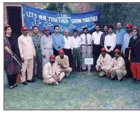
↑ Sowing the seeds of progress. Dadex Lahore Team with TBI Tree.