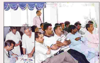
↑ Participants in the plumber training program held in Islamabad on August 22 nd , 2004. Insert: Plumbers are making joints of Polydex pipes at the training.

Hyderabad team organized a Plumbers' Training Program on 14 th July 2004. The training session was on 'Installation Techniques and Precautionary Measures of Polydex & Nikasi'. Certificates were awarded to all the participants at the end of the four hour long session. Next, a plumber training session was organized and conducted at the Regional Office, Islamabad on August 22 nd , 2004. Over 50 plumbers, builders, contractors and dealers participated in the session. All participants were awarded certificates at the end of the training session. Faisalabad Sales Office team organized a training session on September 3 rd , 2004 in collaboration with our local dealer. Over 50 plumbers from several different sanitary markets participated in this session.