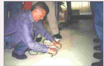
↑ Participants in the Plumber Training Program for the Aga Khan University and Hospital in Karachi.

The Customer Services team conducted a Plumbers' Training Program for the Aga Khan University and Hospital, Maintenance Department team on August 7 th , 2004 at Dadex House. The training session focused on sharing product knowledge and installation techniques for Polydex pipe system. A physical demonstration of pipe jointing was conducted that was followed by participants doing the same. Certificates were awarded to all participants at the end of the training program.