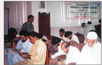
↑ Participants take a final test at the end of the training session at KBCA, Karachi.

The Customer Services team at Dadex conducted a certificate short course on Good Plumbing Practices in association with Karachi Building Control Authority (KBCA). The course extended over a period of four weeks and aimed at training plumbers, supervisors and government engineers on the significance of good plumbing and proper installation techniques of plastic pipe systems. KBCA appreciated the initiative taken by Dadex.