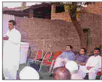
↑ Plumber Training in Faisalabad.