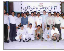
↑ TBI Team Maintenance Department.