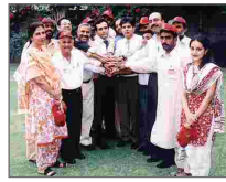
↑ The Lahore Dadex Team at the TBI session.