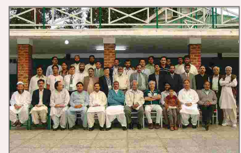
↑ Group photo of all the participants at SABZTECH 2004, Nathiagali.