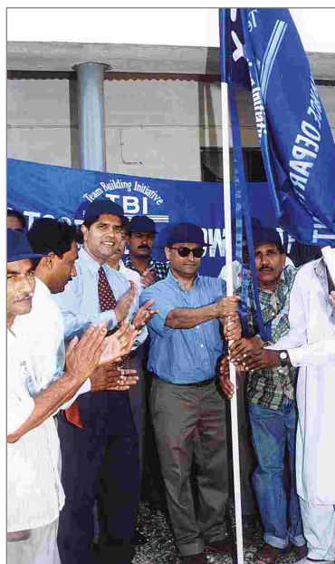
↑ Teams were awarded TBI flags on completion of Phase 1 of the TBI initiative at the Karachi Factory.

At Dadex we have consistently worked towards developing a close knitted culture among employees that bars any differences arising from difference in social strata, colour and cast. For the past 45 years, the Dadex family has collectively worked towards the progress and prosperity of the company. To enhance the existing work environment, develop mutual cooperation and respect for all team members, the HR team has started training programs under the banner of "Team Building Initiative (TBI)" and "Work Ethics".