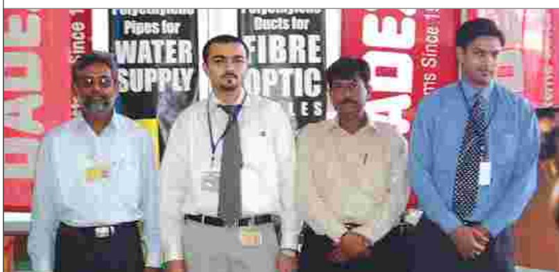
↑ Dadex team at the Dadex stall set up at the IEDC 2004, NED University Karachi.