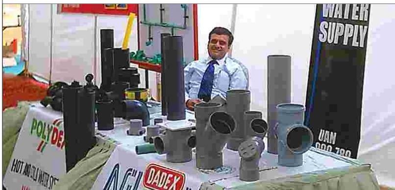
↑ Dadex stall at the Ground Breaking Ceremony by Shamsi Builders Ltd.