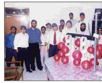
↑ The winning TBI Team – Plastics Department.